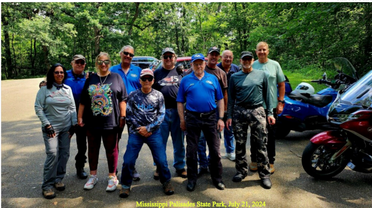
Mississippi Palisades State Park, July 21, 2024